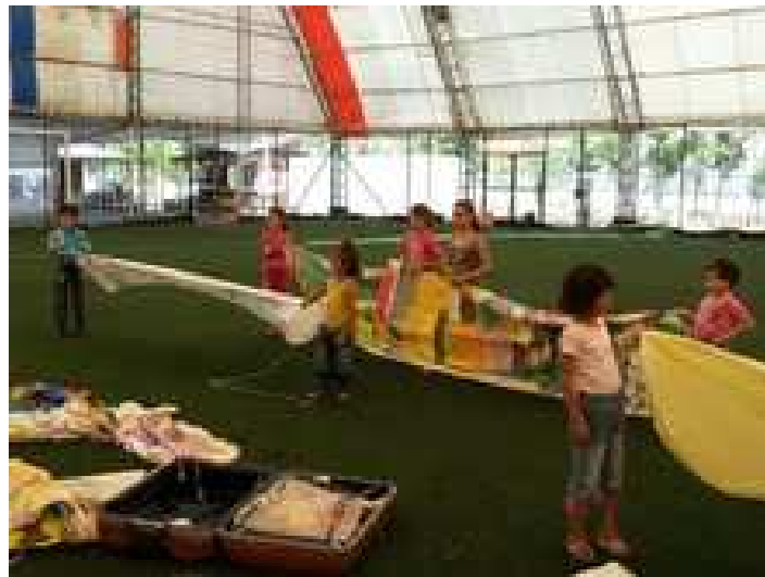
The KOINOBORI (fish) is a symbol of a strong and loving life.