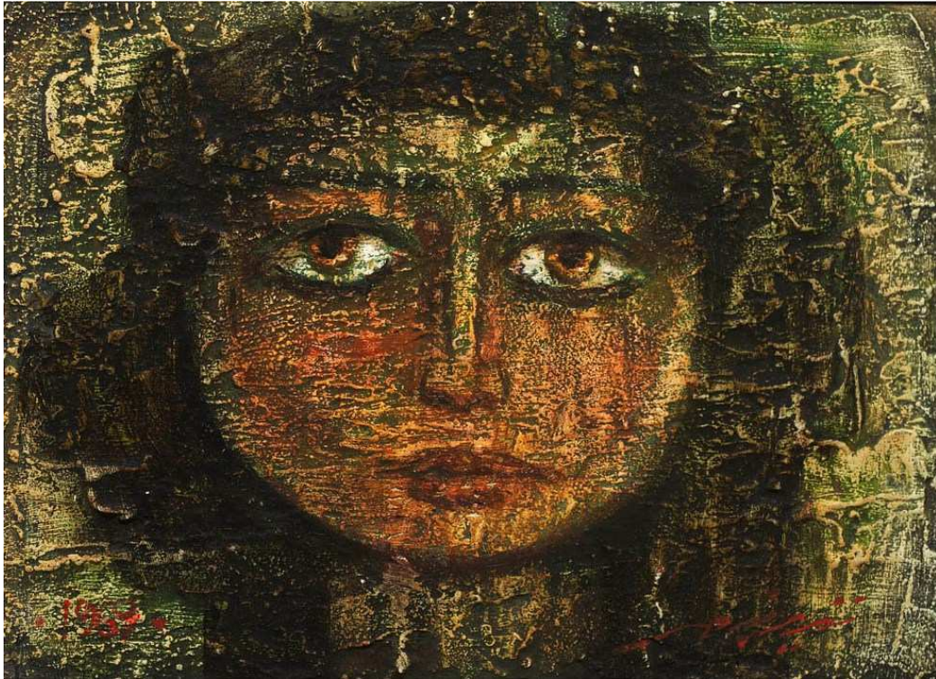
Nazir Nabaq 1969